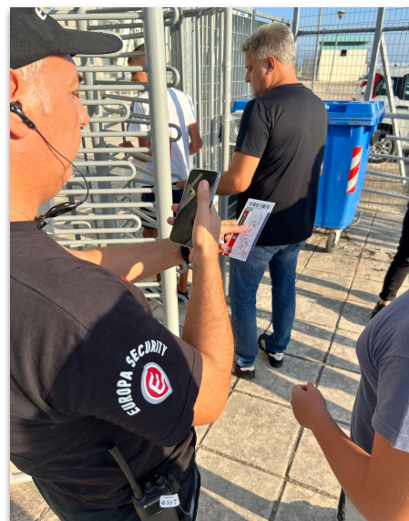
Europa Security staff verifying tickets at the Panthessaliko Stadium. See more